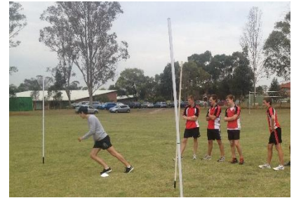
Above: Students participating in an AFL workshop ran by the GWS Giants